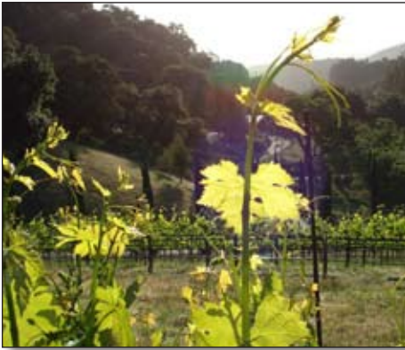
April 24, 2009 - Bud break & flowering of our Estate Barbera

Spring is in the air in Dry Creek. Heavy rains at the first of the year followed by sunshine and temperatures in the 70's are what make grape vines happy and start to push out their little buds. Here in the vineyard this is the beginning of the long push which culminates in the fall harvest. In a few short months the crop will set, the grapes will plump up and begin to change colors, then comes the magic of harvest.