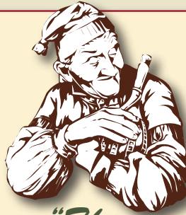
"The Last Love"

For your convenience, we have included an Enrollment Form in this newsletter. Join our family and start including our fine wines with your food and wine courses.